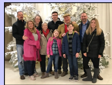
The Yager Family