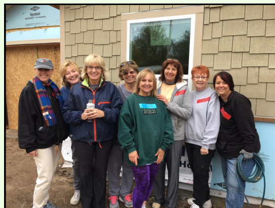
2017 Rotary Women's Build Day

All are welcome to attend the dedication of the Habitat home on Thursday, December 21, from 5:30 to 6:30 pm. The house which our club helped fund and build is located at 1055 N. Green.