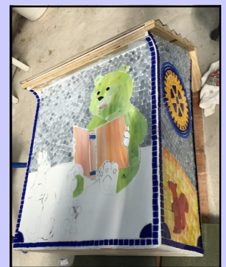
Little Free Library decorated by Gardner Design