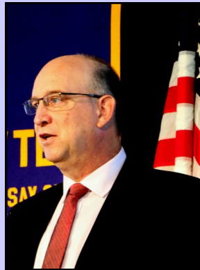
Mayor Jeff Longwell shared recent accomplishments and some exciting developments which are in store for Wichita.