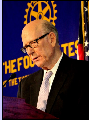
U. S. Senator Pat Roberts visited the club on Monday to share his views on many current topics.