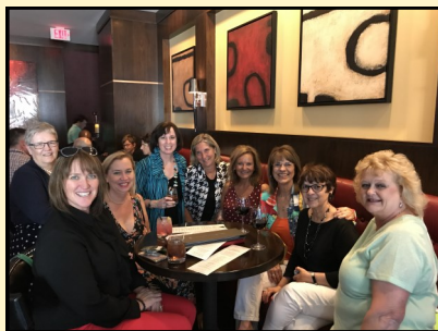
Women Rotarian Night Out Ambassador Hotel Bar — August 2