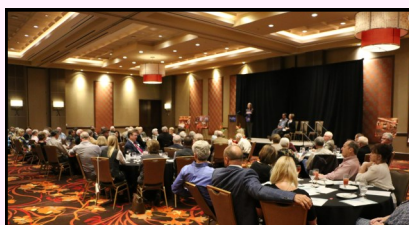
Ballroom at KS Star Event Center

Rotarians and guests enjoyed a delightful and informative evening at the Kansas Star Event Center, including presentations by facility representatives and tours of the Event Center, Hampton Inn & Suites and the Equestrian Center. This was a first time visit for many and several attendees ended the evening at the casino.