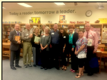
RIF at L'Ouverture