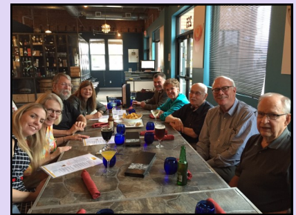
Wednesday evening our club combined the men's monthly Brew & Tattoo with the gal's Happy Hour at Taste & See in Old Town. There was a great turnout and all who attended enjoyed getting to know each other a little better.