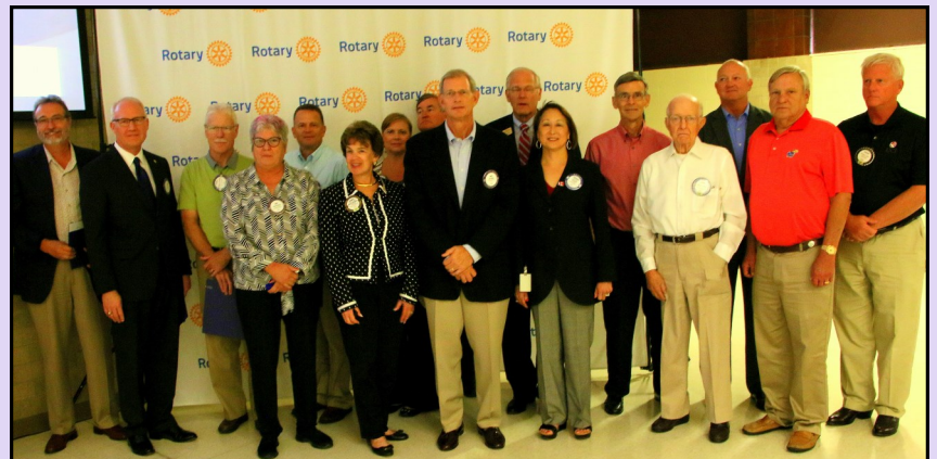
Thank you to the generous donors to the Rotary Foundation who were honored as Paul Harris Fellows on Monday.