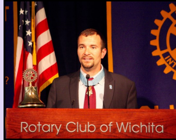
It was inspiring to hear Medal of Honor recipient Sal Giunta tell his story of the bravery and selflessness of his fellow comrades in battle.