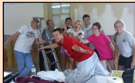
2015 RYLA Camp Participants

Camp participants will learn the characteristics of a true leader and discuss the possibilities and responsibilities of being a leader. Throughout the camp, students will learn about motivation and teamwork. Click here to visit the District 5690 website for more information.