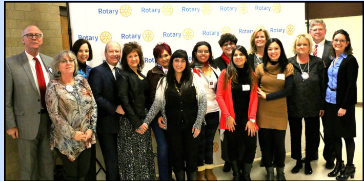
The RITE teachers are pictured with their hosts from the Rotary Club of Wichita.