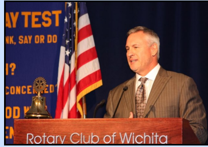
Former MLB baseball player Steve Sax delivered an encouraging message to the high school students in the audience for Career Day about following their dream no matter the obstacles.