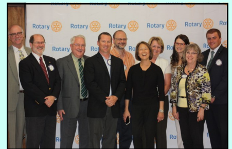
2014-2015 Board Members