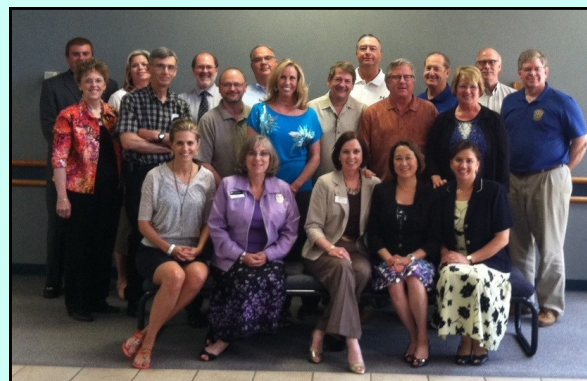
Joint– Board of Directors at Friends University