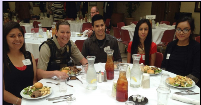
Wichita police officer and students