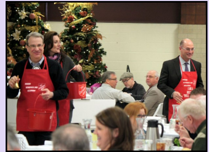
Enthusiastic members of the Bucket Brigade raised nearly $22,000 for the Salvation Army in less than 5 minutes.